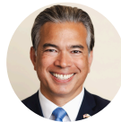
Rob Bonta Office of the Attorney General State of California

Tuesday • March 25, 2025 • 5:30 - 6:45 p.m. Reception to follow.